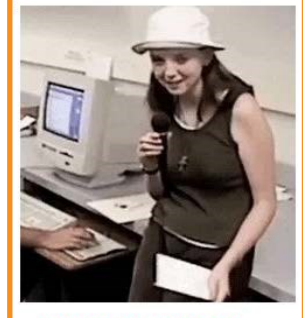
"I had my ups and downs. I fell a few times, but I did not give up. Don't give up."